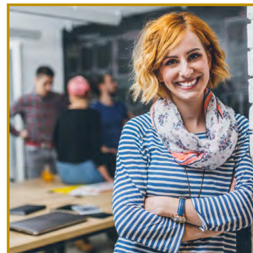
Human Resources Community Support