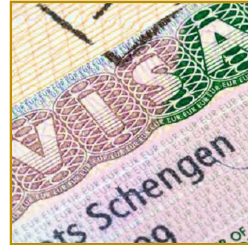
Stay Permits Administration