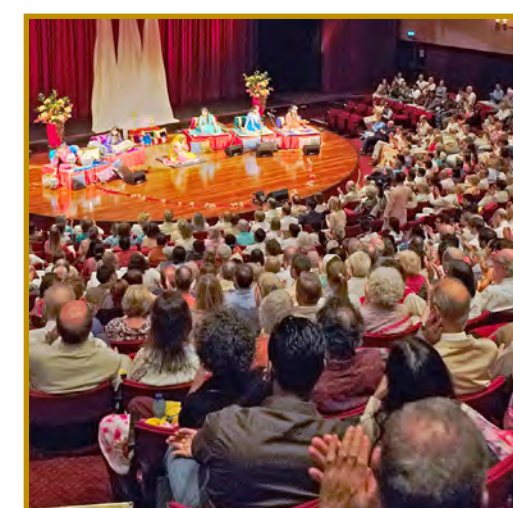
V.I.P. Seating at Events