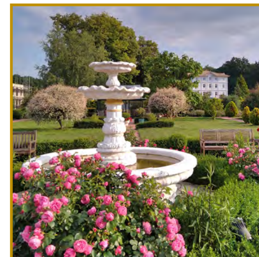
Upkeep of the MERU Gardens