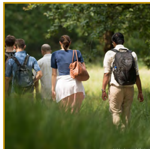
Opportunities for Recreation