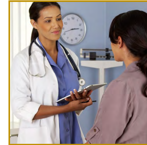
Health Care Assistance