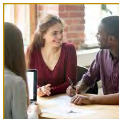
Assistance for Guest Accommodations