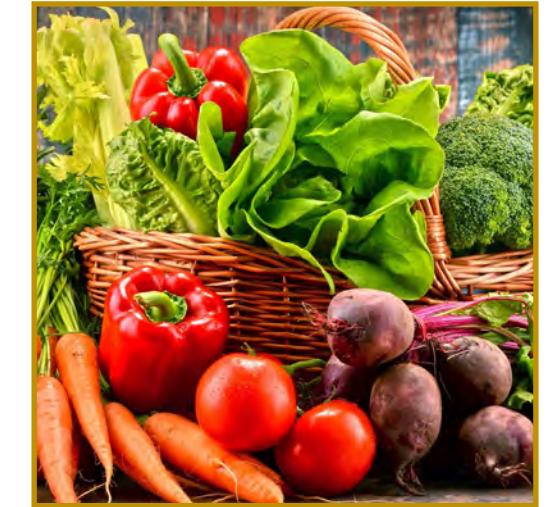
Community Dining Hall and Organic Food Store